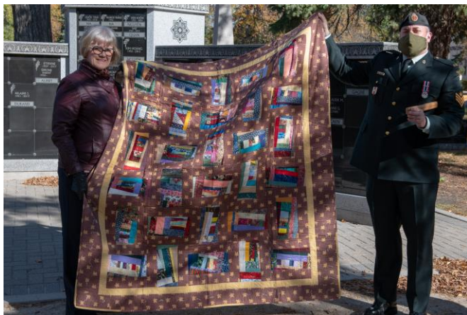
Figure 4 Quilt of Valour