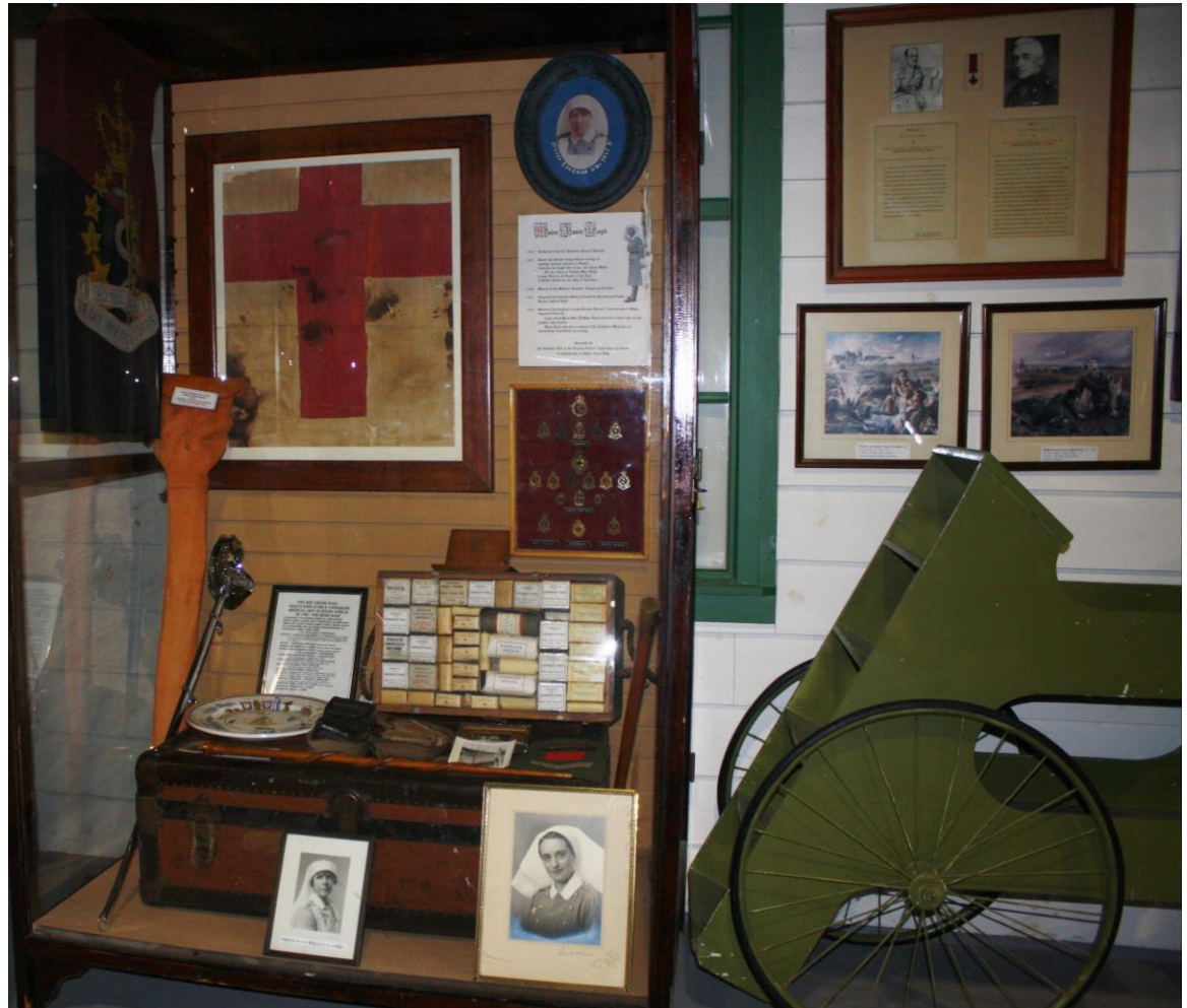
Canadian Forces Base Borden Museum Military Medical Artifact Collection