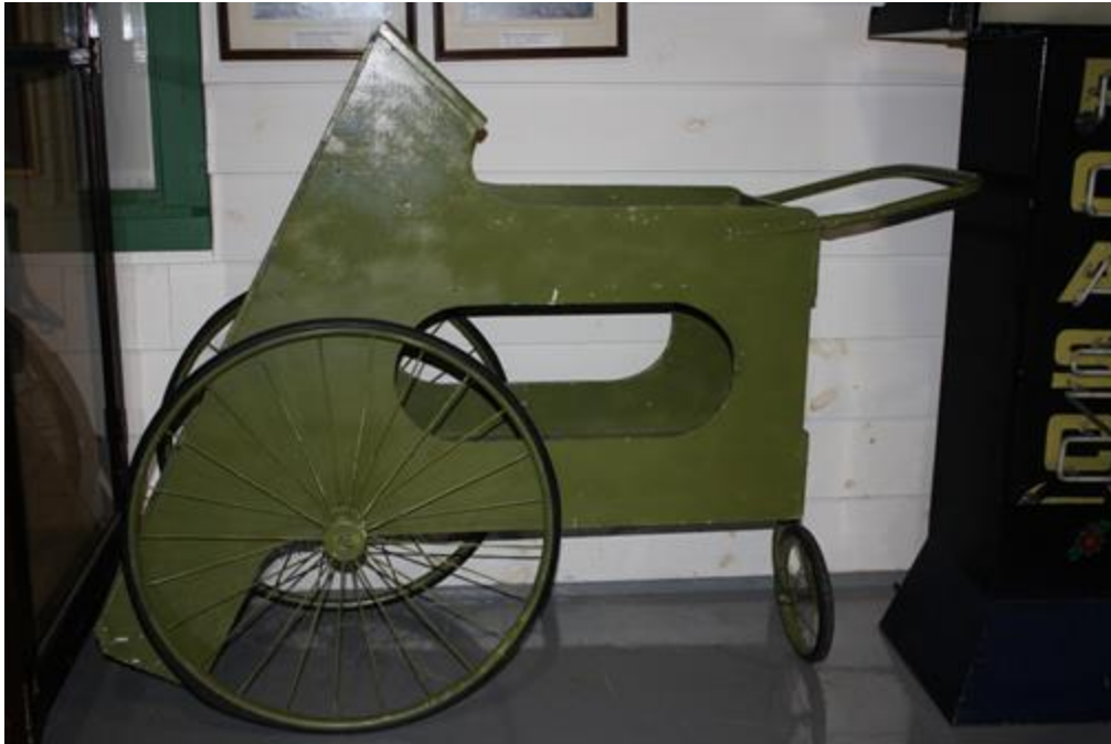
Nursing Sister's Cart Presented June 1941 to Camp Borden Military Hospital by Overseas Nursing Sisters Assoc Of Canada, Toronto Unit 1914-1918