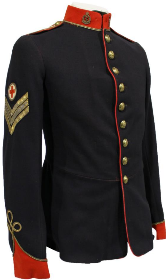
Canadian Army Medical Corps Dress Uniform Circa 1900