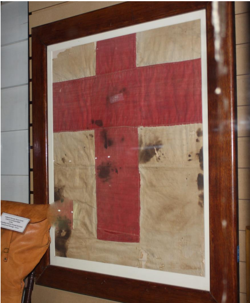
Canadian Forces Base Borden Museum Military Medical Artifact Collection

THIS RED CROSS FLAG WAS FLOWN OVER A CANADIAN MEDICAL UNIT IN SOUTH AFRICA IN 1901 "THE BOER WAR" CANADIAN VOLUNTEERS FROM ALL PROVINCES MILITIA UNITS JOINED INTO COMPOSITE OR REGULAR UNITS FOR SOUTH AFRICA MANY WERE TURNED AWAY AS VOLUNTEERS FAR EXCEEDED REQUIREMENTS ALL CANADIAN ARMY UNITS WERE 1 ST CANADIAN CONTINGENT ROYAL CANADIAN REGIMENT (1 st Battalion) This Battalion was drawn from all Militia Units in Canada plus the few Regulars of the Canadian Army. It included members of other famous Canadian Units and Corps. ROYAL CANADIAN ARTILLERY (several staff Officers) CANADIAN MEDICAL CORPS (Doctors, Nurses and orderlies) CANADIAN CHAPLAIN CORPS (Protestant, Roman Catholic) 2 ND CANADIAN CONTINGENT CANADIAN MOUNTED RIFLES, 1 st BATTALION Drawn from Regular & Militia Cavalry Units. CANADIAN MOUNTED RIFLES, 2 ND BATTALION Drawn from North West Mounted Police & Militia Units. ROYAL CANADIAN FIELD ARTILLERY Drawn from Regular & Militia Artillery Units. STRATHCONA'S HORSE CANADIAN This Regiment was paid for and raised by Mr Donald Smith, later LORD STRATHCONA & MOUNT ROYAL from his own finances. It was recruited by volunteers from Regular, Militia, and North-West Mounted Police. CANADIAN BRIGADE - DIVISION ARTILLERY was also raised, other corps involved in South Africa were: CANADIAN ARMY SERVICE CORPS (staff & Resupply) CANADIAN VETERINARY CORPS CANADIAN POSTAL CORPS.