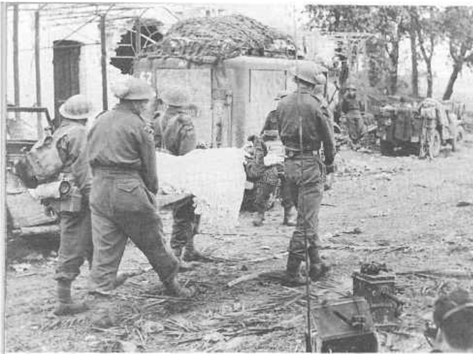
Archives du Régiment 22e, No. PH3 / 172 / 130